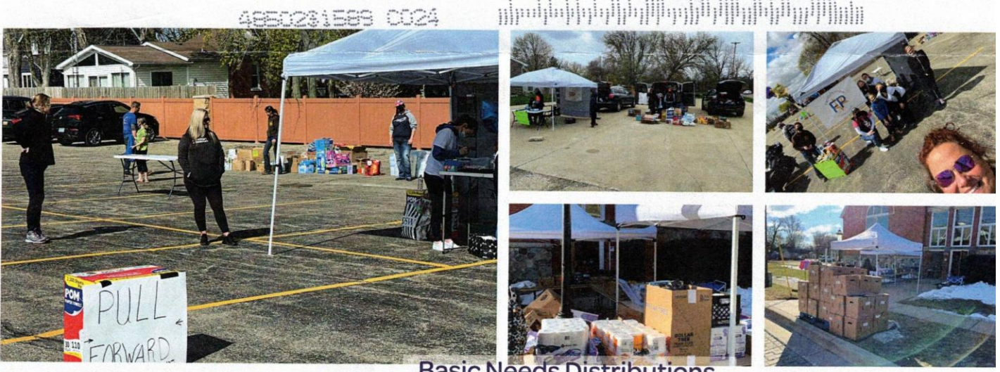
Basic Needs Distributions

St. Paul's Episcopal Church 711 S. Saginaw Street Flint, MI 48502